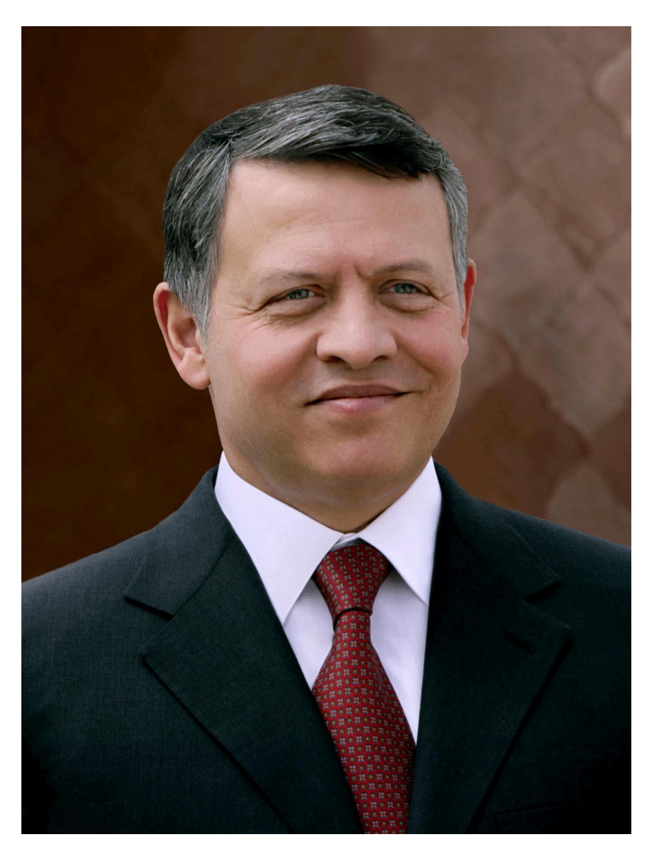
His Majesty King Abdullah II Bin Al Hussein